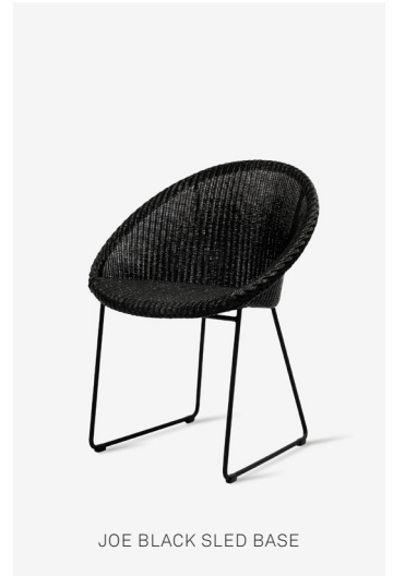
JOE BLACK SLED BASE