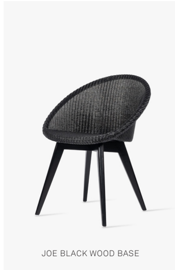
JOE BLACK WOOD BASE