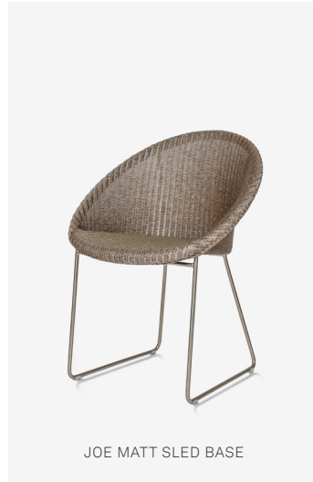
JOE MATT SLED BASE