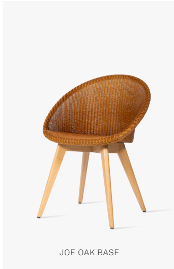
JOE OAK BASE