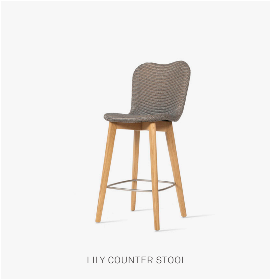
LILY COUNTER STOOL