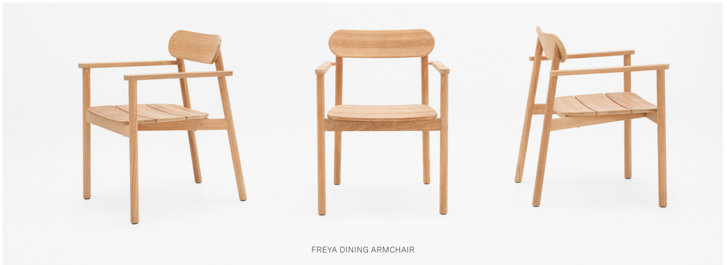
FREYA DINING ARMCHAIR