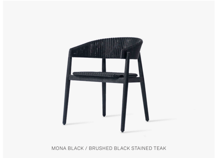
MONA BLACK / BRUSHED BLACK STAINED TEAK