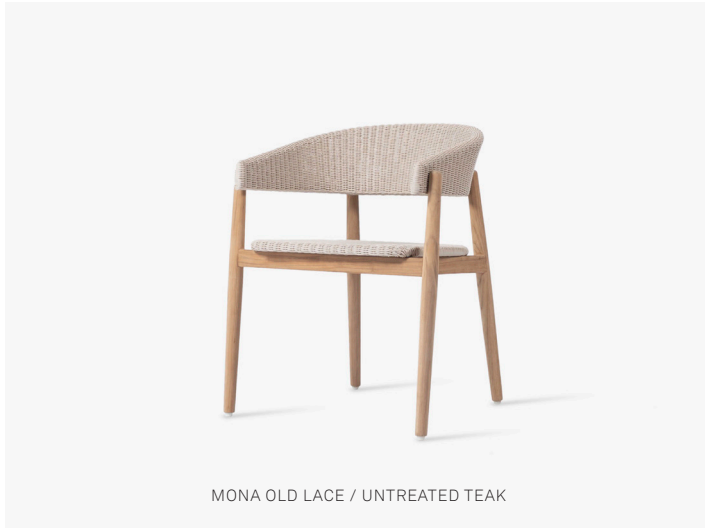
MONA OLD LACE / UNTREATED TEAK