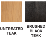
UNTREATED TEAK BRUSHED BLACK TEAK