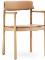
Timb Armchair upholstery Tan / Ultra Leather - Camel