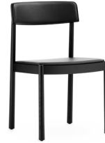
Timb Chair upholstery Black / Ultra Leather - Black