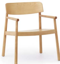
Timb Lounge Armchair Tan