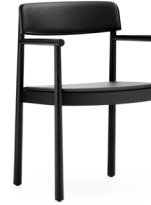
Timb Armchair upholstery Black / Ultra Leather - Black