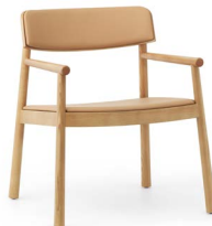
Timb Lounge Armchair upholstery Tan / Ultra Leather - Camel