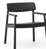
Timb Lounge Armchair upholstery Black / Ultra Leather - Black