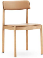
Timb Chair upholstery Tan / Ultra Leather - Camel