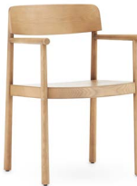
Timb Armchair Tan