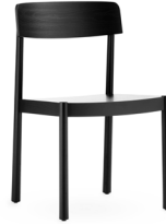
Timb Chair Black