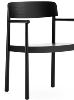
Timb Armchair Black