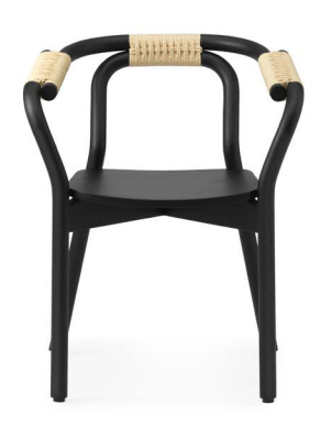
Knot Chair Black/Nature