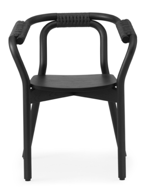
Knot Chair Black/Black