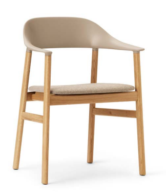
Herit Armchair textile Sand, Oak