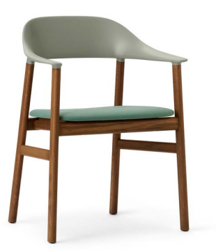
Herit Armchair leather Dusty Green, Smoked Oak

Shell Color: Black, White, Grey, Sand, Dusty Green Frame Color: Oak, Smoked Oak, Black Oak