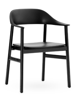
Herit Armchair Black, Black Oak