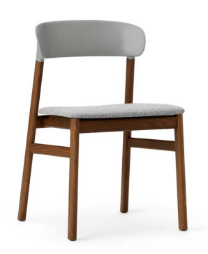
Herit Chair textile Grey, Smoked Oak