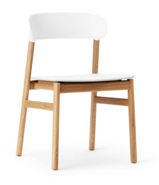
Herit Chair White, Oak