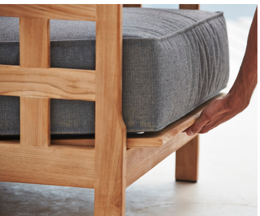
Innovative and smart seat sliding function, which allows the seat to be pushed forward, giving the chair a reclined seating position.

Cane-line Softtouch® is a combination of 48% coated polyester sling and 52% solution-dyed acrylic fabric. Cane-Line tex® is made of 100% coated polyester sling.