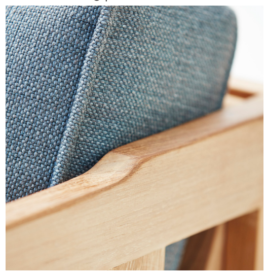
Cane-line Teak is supplied from WWF/GFTN, certified members in Indonesia, whose teak originates from Perhutani and comes from responsible managed forests.