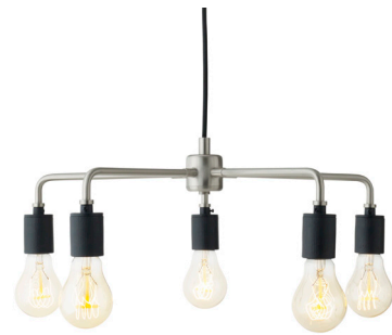
Brushed Steel 1910039