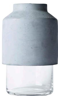
Light Grey 4736039